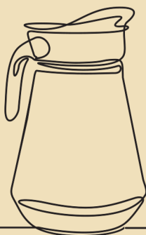
SMALL JUG ~ 20