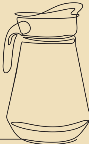
LARGE JUG ~ 38

“Sangria is originated in Spain and Portugal” A punch, sangria traditionally consists of red wine and chopped fruit!