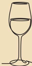
GLASS ~ 14